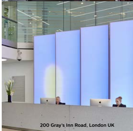
200 Gray's Inn Road, London UK