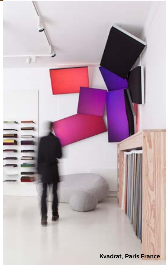
Kvadrat, Paris France

Luminous textile is not intended for detailed text messages. Rather than overloading the senses, it creates soft atmospheres and ambiances. The combination of soft, diffused light and the aesthetics of the material creates a very special effect that has an almost dreamlike quality. With design freedom and fully customizable content, it makes the possibilities for mood creation endless. How will it light your creativity?