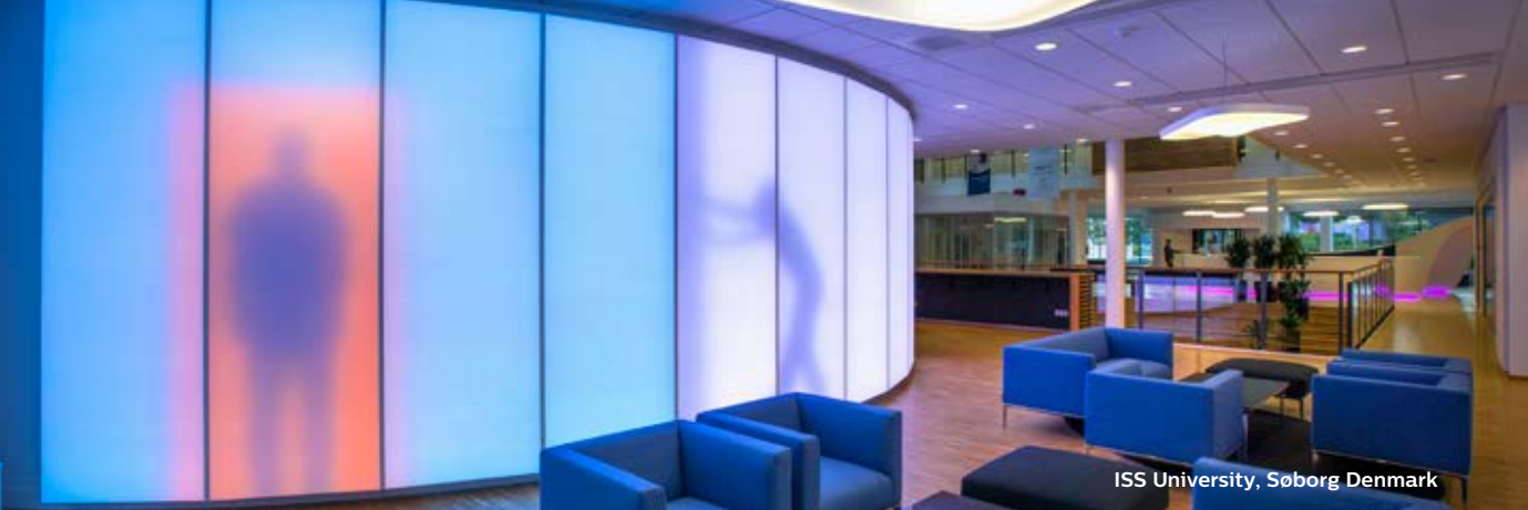
ISS University, Søborg Denmark