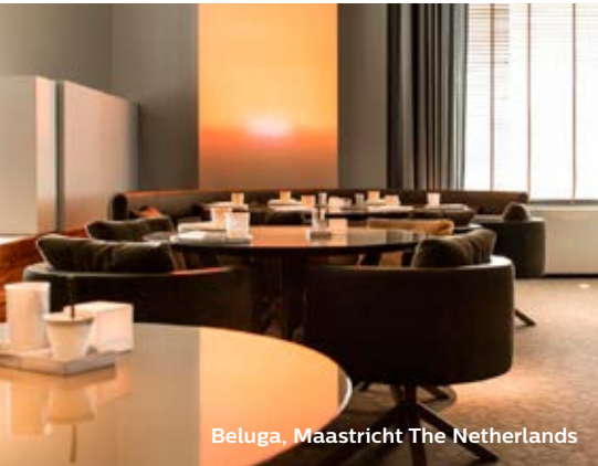
Beluga, Maastricht The Netherlands

Every space demands its own meaningful solution. Luminous textile helps you achieve your boldest visions and capture the essence of a space in a totally unique way.