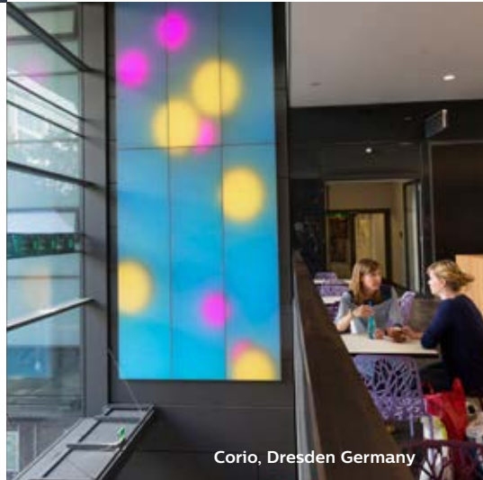
Corio, Dresden Germany

Modern offices can feel cold and impersonal. Luminous textile is the perfect way to emphasize your company's personality. It adds the warmth and inspiration that stimulates creativity, improves productivity and energizes office life. With softened sound to improve concentration and promote well being. So business is a pleasure.