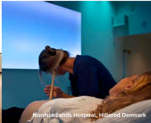
Nordsjællands Hospital, Hillerød Denmark