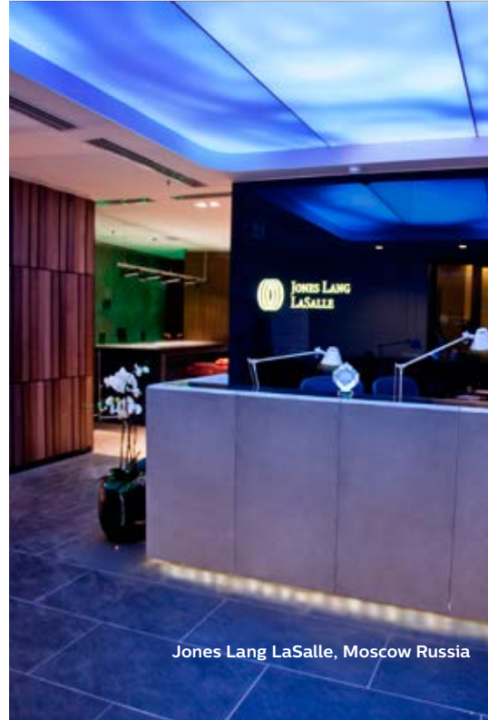
Jones Lang LaSalle, Moscow Russia